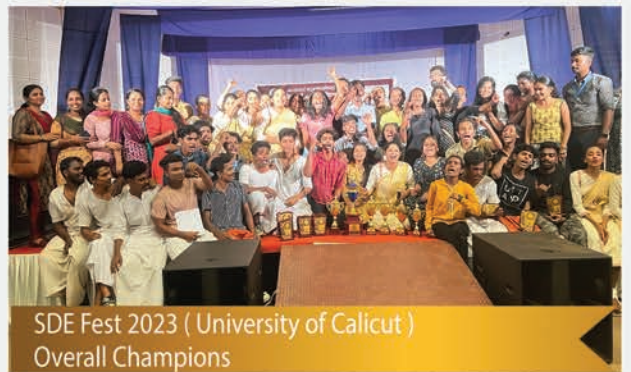
SDE Fest 2023 ( University of Calicut ) Overall Champions