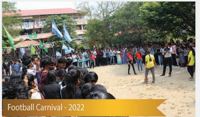
Football Carnival - 2022