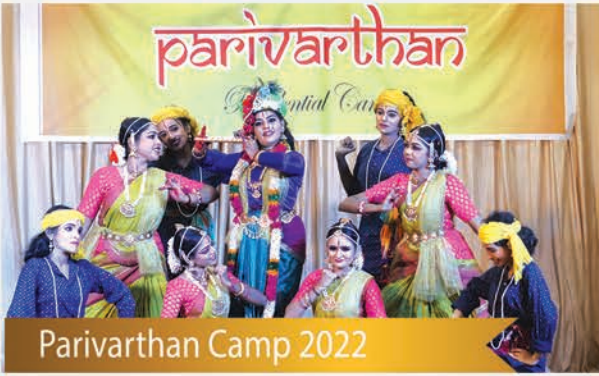
Parivarthan Camp 2022