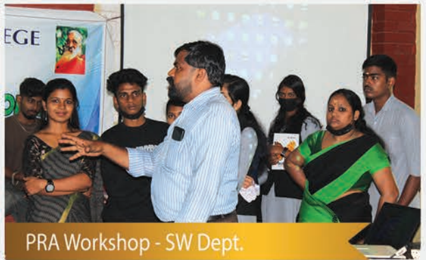
PRA Workshop - SW Dept.