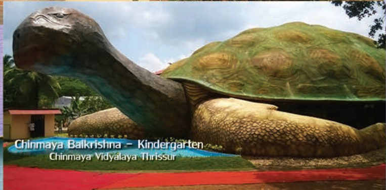
Chinmaya Balkrishna - Kindergarten Chinmaya Vidyalaya Thrissur