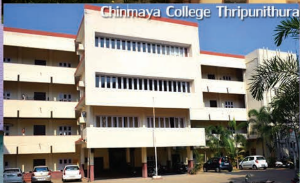
Chinmaya College Thripunithura