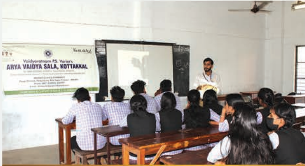
awareness about the benefits of Ayurveda