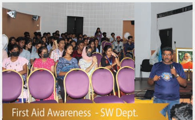
First Aid Awareness - SW Dept.