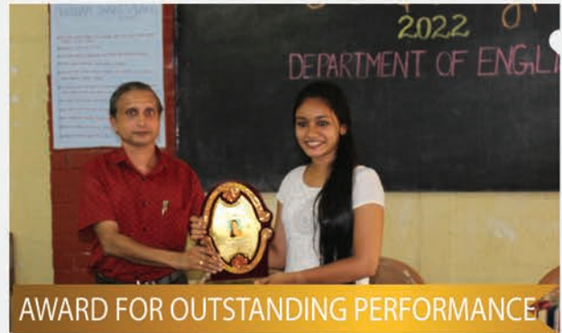
AWARD FOR OUTSTANDING PERFORMANCE