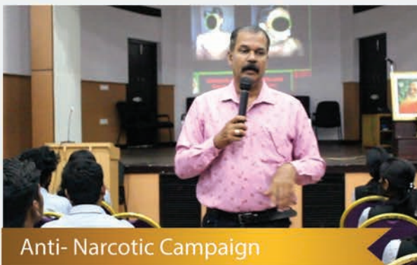
Anti- Narcotic Campaign