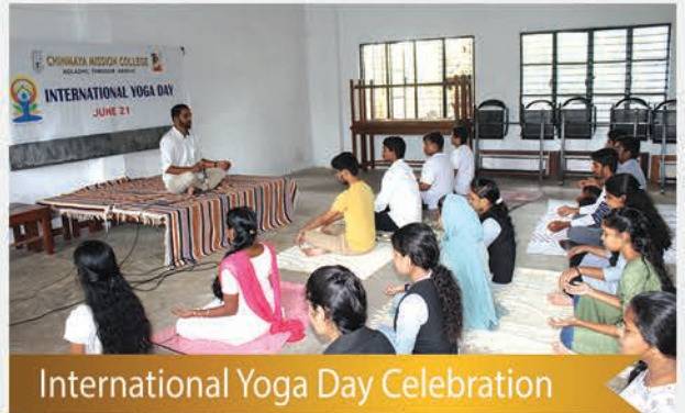
International Yoga Day Celebration