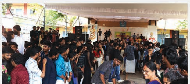
Onam - 2022