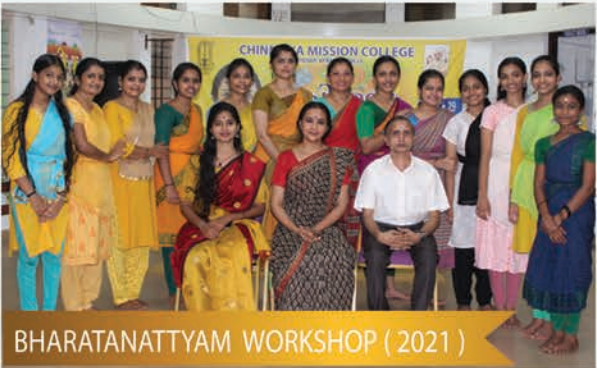
BHARATANATTYAM WORKSHOP ( 2021 )