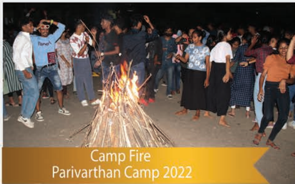
Camp Fire Parivarthan Camp 2022