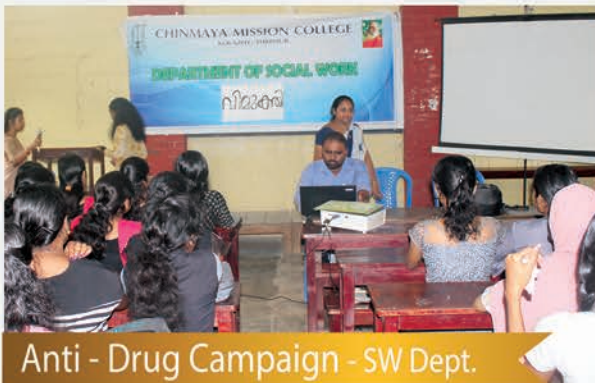
Anti - Drug Campaign - SW Dept.