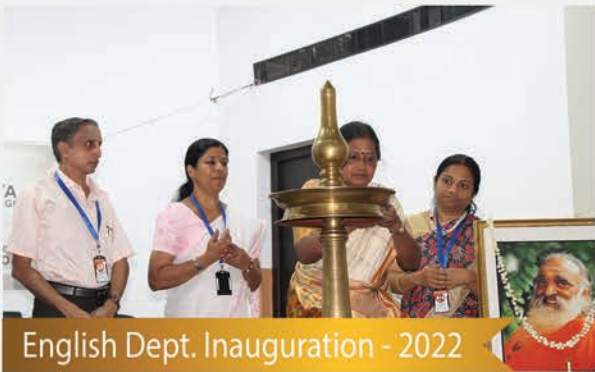
English Dept. Inauguration - 2022