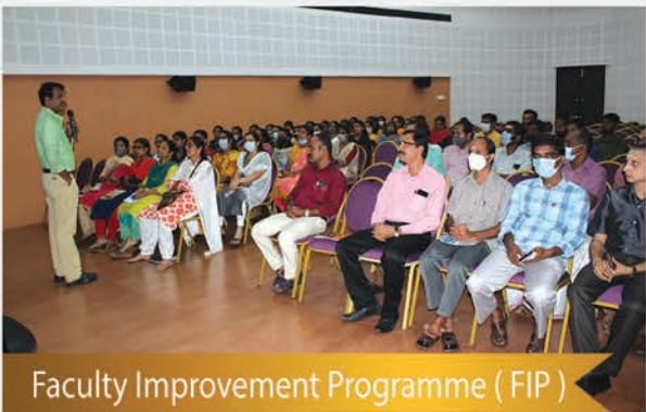
Faculty Improvement Programme ( FIP )