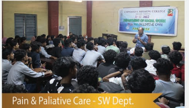
Pain & Palliative Care - SW Dept.