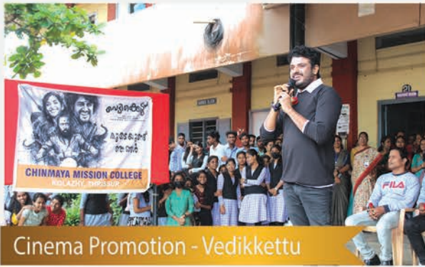
Cinema Promotion - Vedikkettu