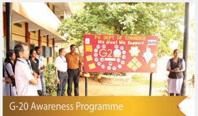
G-20 Awareness Programme