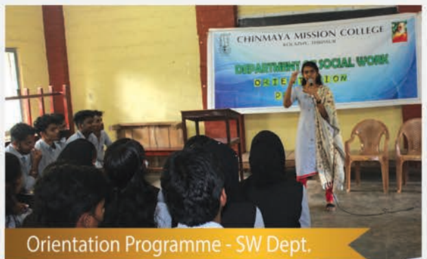
Orientation Programme - SW Dept.