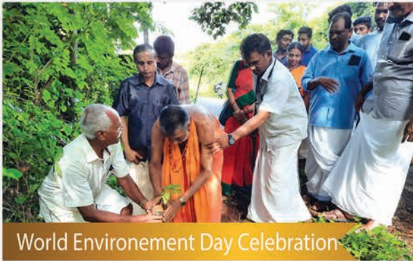
World Environment Day Celebration