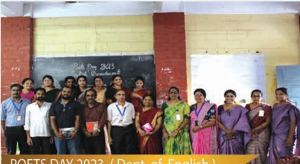
POETS DAY 2023 ( Dept. of English )