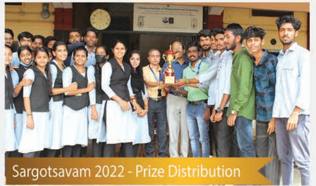
Sargotsavam 2022 - Prize Distribution