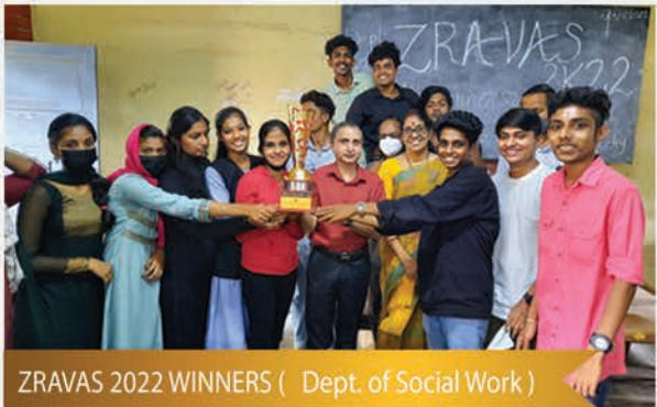
ZRAVAS 2022 WINNERS ( Dept. of Social Work )