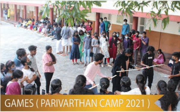
GAMES ( PARIVARTHAN CAMP 2021 )