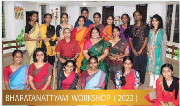
BHARATANATTYAM WORKSHOP ( 2022 )