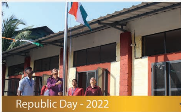
Republic Day - 2022