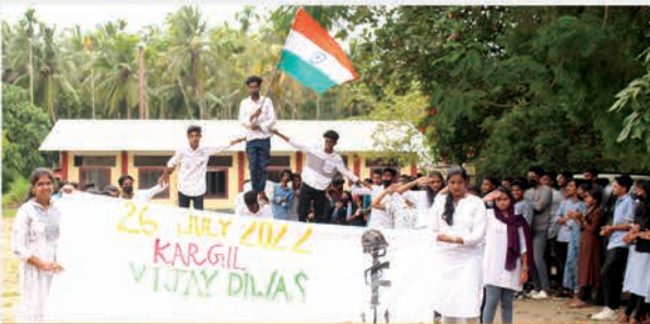
kargil Vijay Divas Celebration