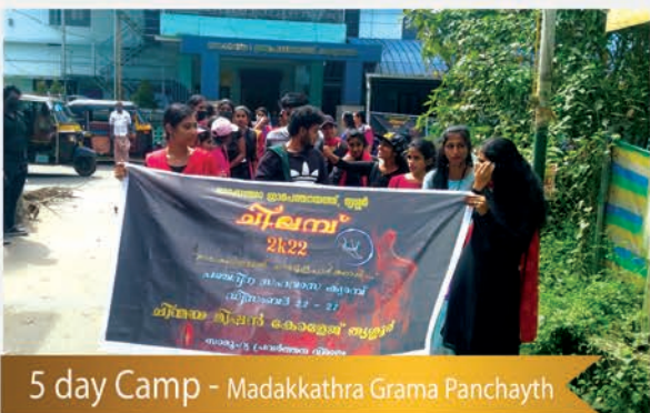
5 day Camp - Madakkathra Grama Panchayth