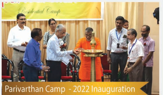
Parivarthan Camp - 2022 Inauguration