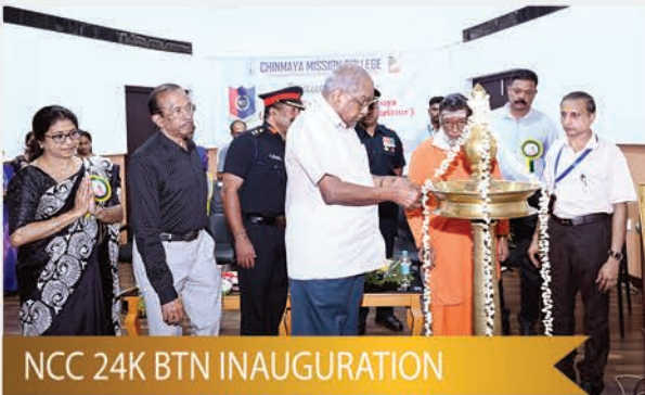
NCC 24K BTN INAUGURATION