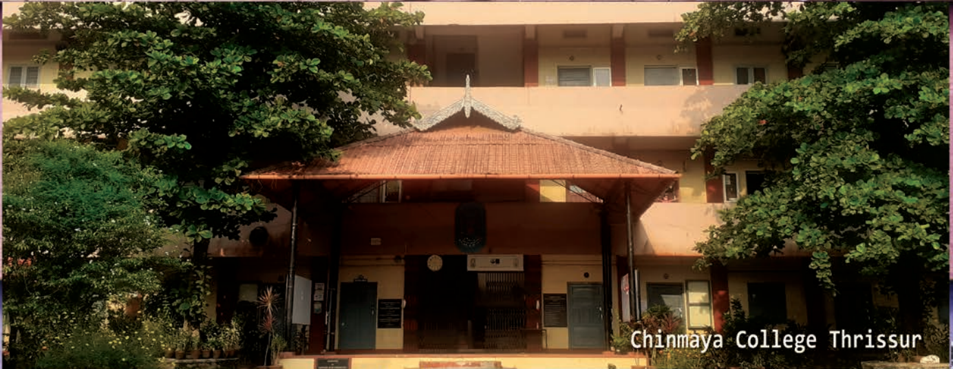
Chinmaya College Thrissur