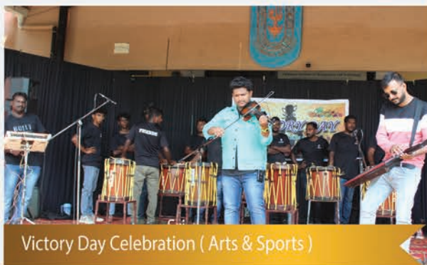
Victory Day Celebration ( Arts & Sports )